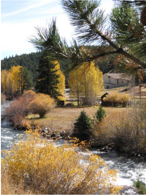
North Fork of the Platte River, Bailey, CO